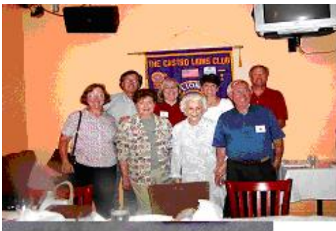
Foster City Lions Visitation