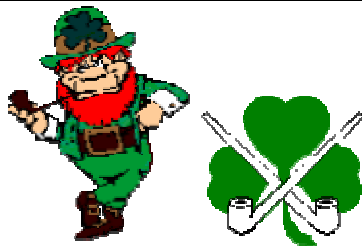
Happy Saint Patrick's Day!