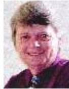
Fellow Lions & friends